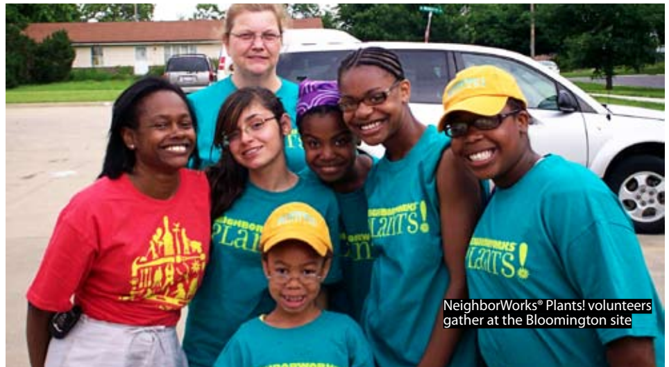
NeighborWorks® Plants! volunteers gather at the Bloomington site

On June 6, armed with spades, shovels, and 15 flats of flowers, 30 Bloomington residents showed up to beautify part of the Gridley Allin Prickett neighborhood. With the help of the Master Gardeners of Bloomington the public street corners and 11 homes had their yards landscaped, the grass trimmed and their trees cut back, kicking off a celebration of neighborhood revitalization activities nationally recognized as National NeighborWorks® Week.