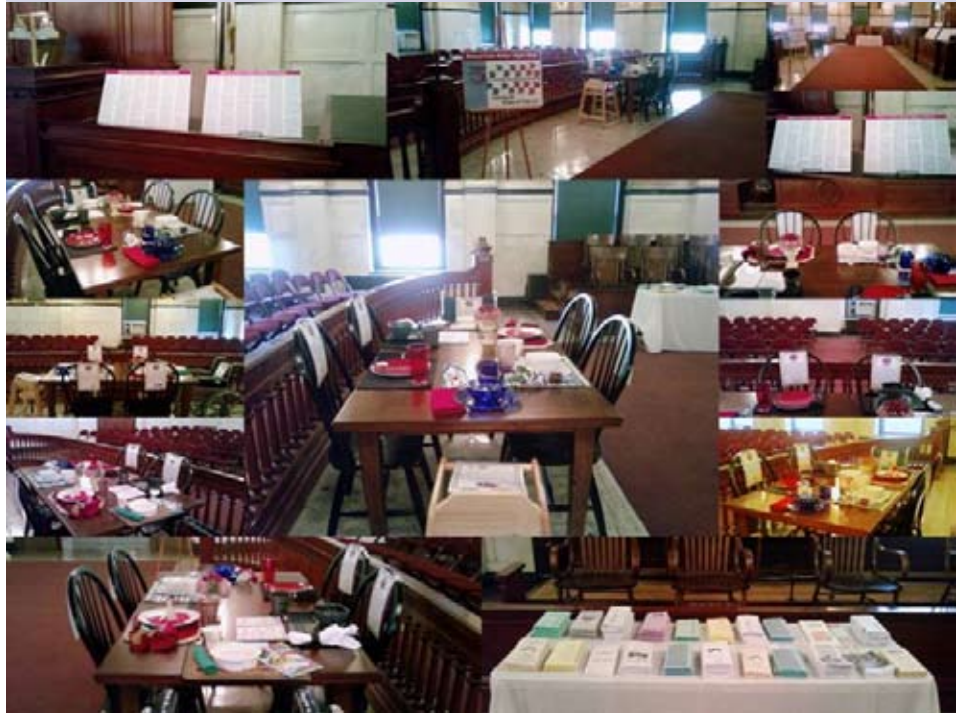
Countering Domestic Violence participated in McLean County's An Empty Place at the Table exhibit during National Crime Victims' Rights Week. This empty seat represents a brave woman who utilized her right to protection by seeking and obtaining an Emergency Order of Protection, only to be murdered by her ex-boyfriend three days later at her residence. The offender remains in prison.