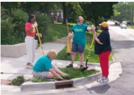
NeighborWorks® Plants! on Bloomington's west side

During National NeighborWorks® Week, Mid Central Community Action, Inc. and other NeighborWorks® organizations across the country mobilized tens of thousands of business people, residents and government officials in a week of neighborhood change and awareness. They rehabbed and repaired homes, painted and landscaped properties, conducted neighborhood tours, recognized successful partnerships and hosted a number of events that educate, train and inform. ●