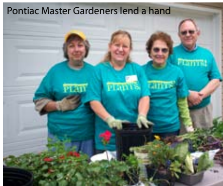
Pontiac Master Gardeners lend a hand

MCCA is part of the national NeighborWorks® network, an affiliation of more than 230 nonprofit organizations that increase homeownership, produce affordable housing and revitalize neighborhoods in more